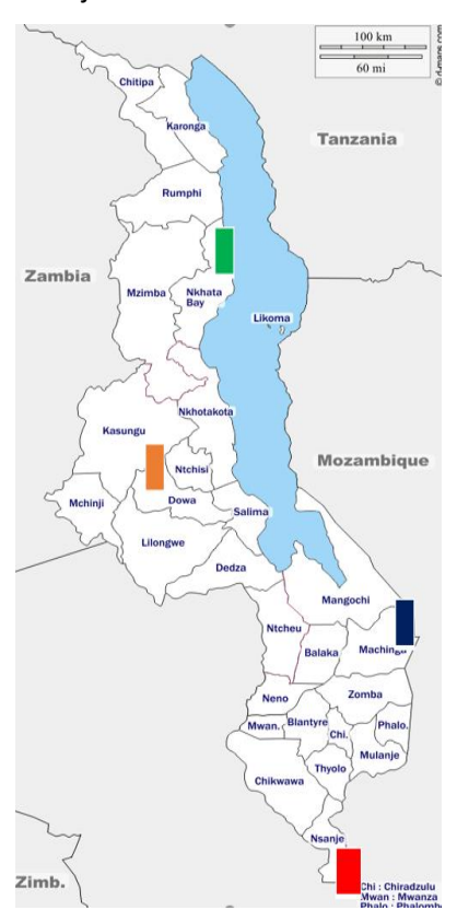
Figure 3: Map of Malawi showing the four targeted districts; Nkhatabay, Dowa, Machinga and Nsanje districts.

Dowa district is 38 kilometers away from the capital city Lilongwe. The district has an area of 3,077 km² with a population of 772,569 people of which, 40,000 are refugees living in the Dzaleka refugee camp. Nsanje is a flood-prone area and the warmest district in Malawi with temperatures reaching up to 42 degrees Celsius during the hot dry season. The district is found further down south and covers a land of 1,945 Km² and neighboring districts for Nsanje include Chikwawa and Thyolo, and for the most of Nsanje, it is surrounded by Mozambique. Nsanje has a population of 299,168 people, whose majority are from the Sena tribe.