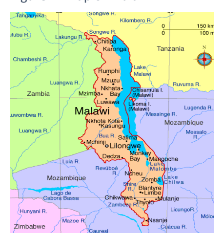
Figure 1: Map of Malawi

According to the United Nations Development Programme (UNDP) report for 2019, Malawi has a Human Development Index score of 0.485, placing it at 172 out of 187 countries and an overall Gender Inequality Index (GII) score of 0.615; ranked 149 out of 162 countries reflecting high levels of inequality in reproductive health, women's empowerment, and economic activity (UNDP, 2019).